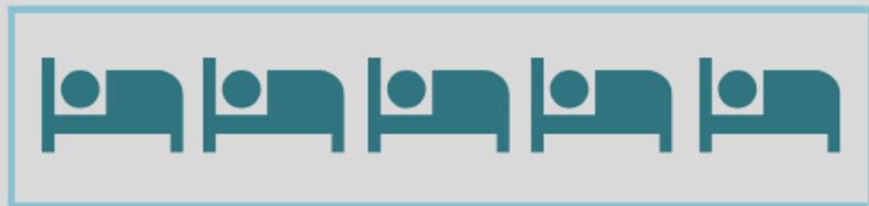
Beds + Units